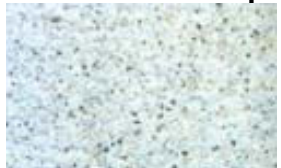
Code: MS 51 Texture Stone Chip