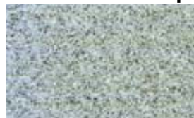
Code: MS 57 Texture Stone Chip