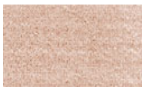
Code: GS 23 Texture Stone Chip