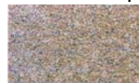
Code: MS 55 Texture Stone Chip