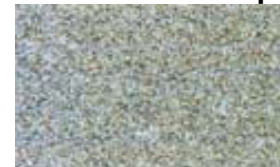
Code: MS 59 Texture Stone Chip