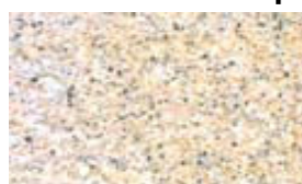
Code: MS 53 Texture Stone Chip